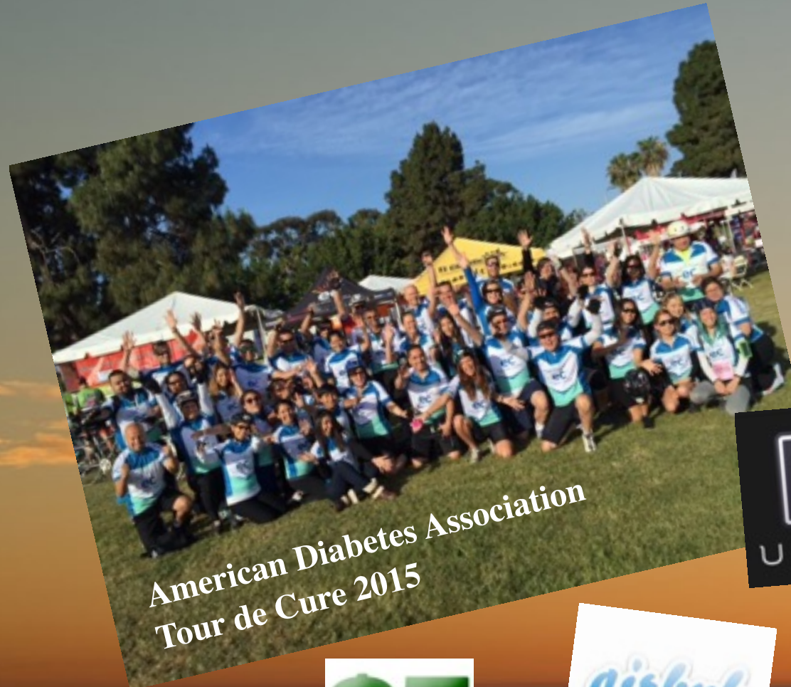
American Diabetes Association Tour de Cure 2015